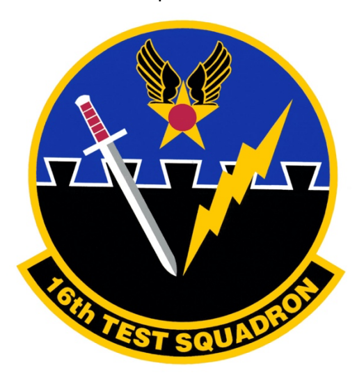
16 Test Squadron emblem approved, 4 Aug 1995